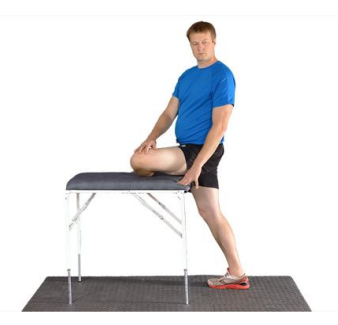
Rotate toward hip