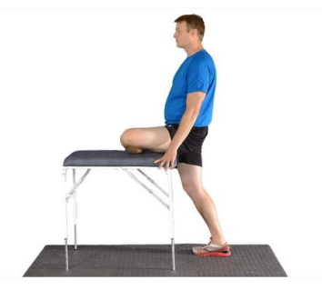
Lean forward from the hip