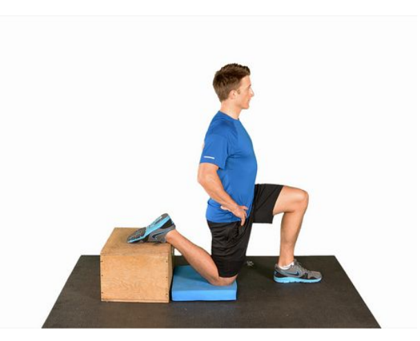
Keep pelvis rotated